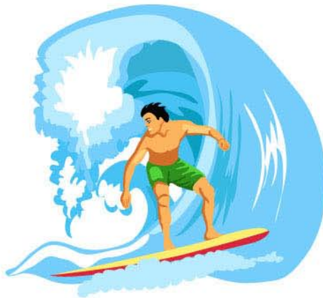
big wave surfing